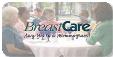
BreastCare TV Spots

SFY08 – Enrollment goal was back to maintaining status quo numbers. Budget remained the same as previous year. Shortly after beginning of the fiscal year, The Communications Group worked with BreastCare to reduce budget expenditures so that BreastCare could continue providing as many services as possible.