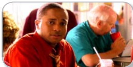
Healthy Delta TV Spot