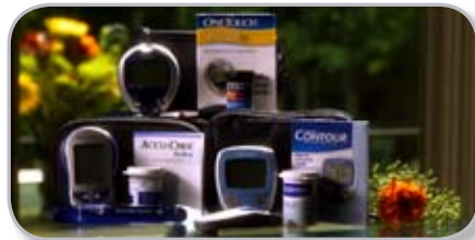
Healthy Delta TV Spot